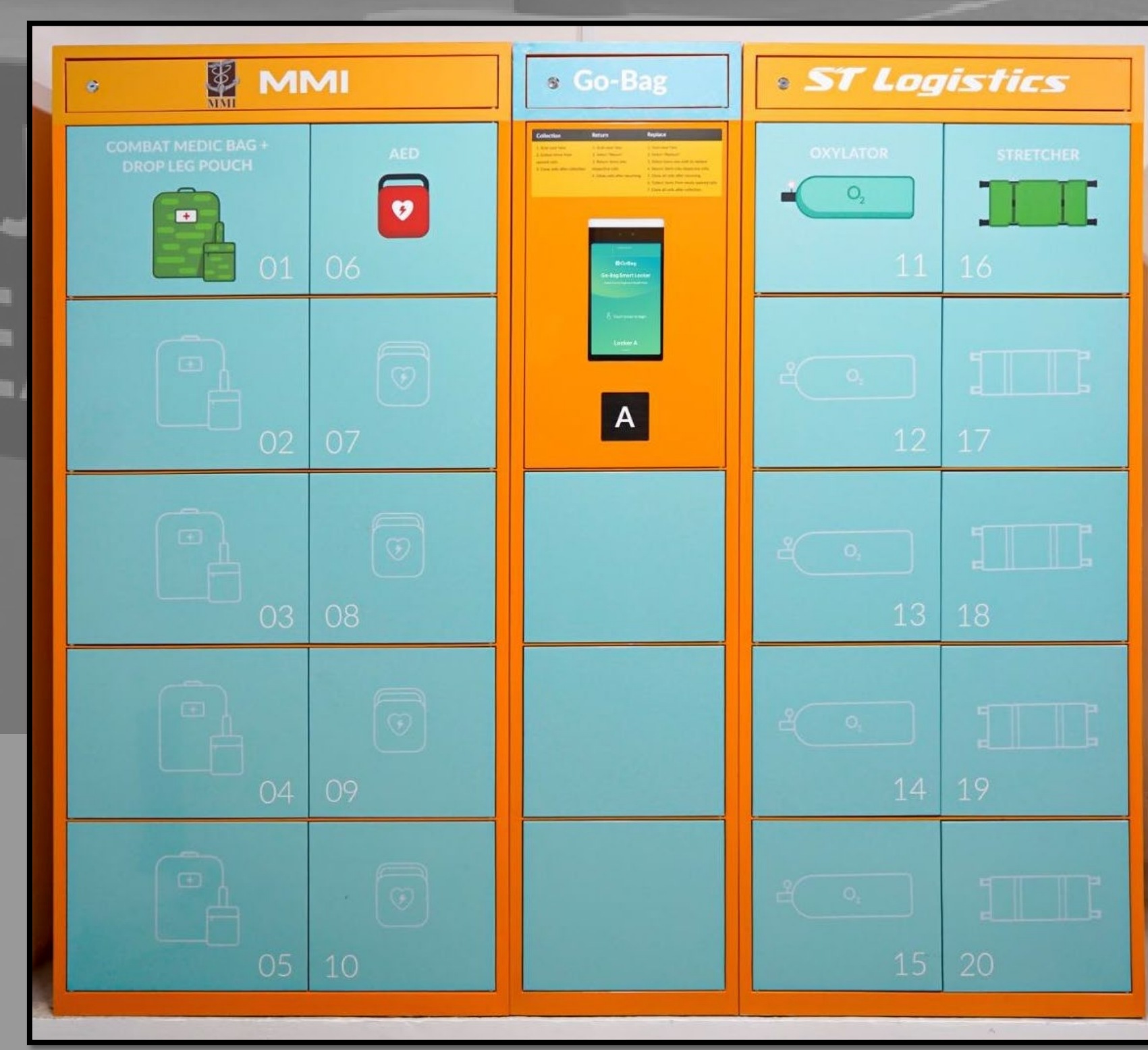
Medical Dispensary System (MDS)